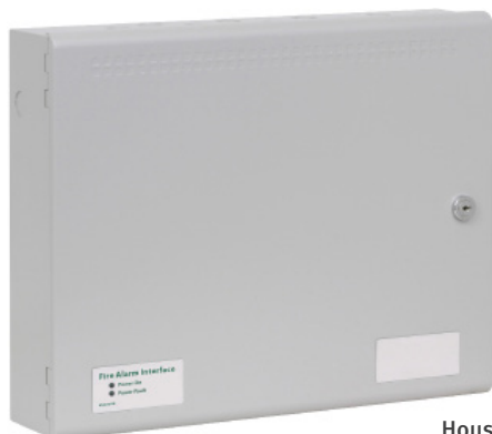
Housed version: K85000 M2

Vizulinx can be used with Kentec's full range of Addressable and Conventional fire alarm systems.