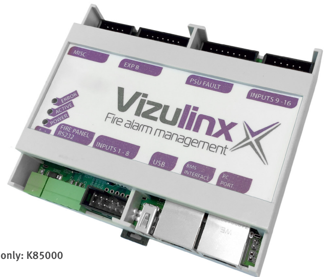
Module only: K85000

*BACnet support currently only available for Taktis systems